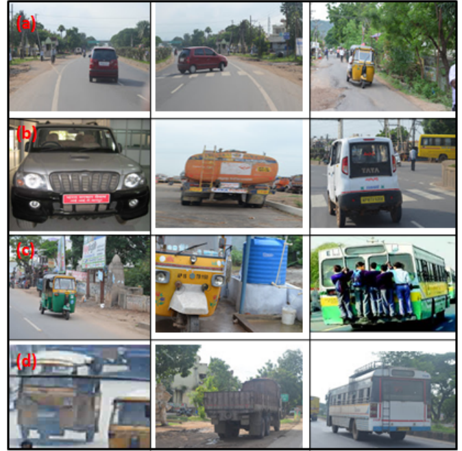
Figure 6: In the process of recognizing Indian vehicles the system has attained some failures . The important reasons noticed are due to (a)very small objects, (b)novel models (in car, truck and auto as an example), (c)clutter and (d)images with poor quality

Quality of the image has a key role in recognition. Important reason is it has a direct influence on performance of edge based features like sift which is implemented in this method. Figure 6(d) shows some images with poor quality. Recognition percent is observed to be very low in this case.