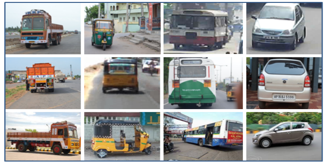
Figure 2: Sample Images from Indian Vehicle database includes four classes (Truck, Auto, Bus and Car respectively). Images were captured with variance in pose, view and lightning constraints.

In order to apply vehicle recognition in Indian scenario, we have introduced Indian vehicle database in this paper. It is build by capturing vehicle images on several Indian highways and traffic roads. Vehicle types considered are Auto, Car, Bus and Truck. Sample images from the entire database are shown in figure-2. The complete description is presented in Table-I.