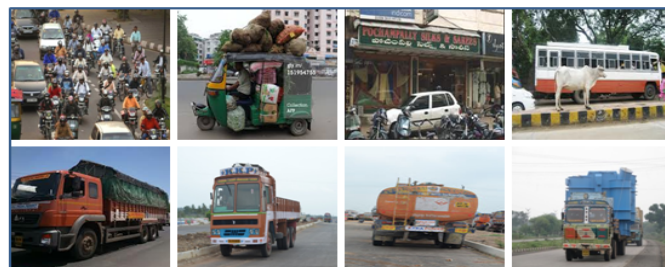
Figure 1: The two important challenges in vehicle recognition to apply for Indian scenario Row1 : Complex road conditions (non lane system, heavy loaded vehicles, unstructured vehicle parking system and obstacles on roads respectively) Row2 : Intra-class variation among vehicles, here Truck is shown as an example.

Although vehicle recognition has been an area of recent interest to the Computer Vision community, no prior research study has been used to build an on-road vehicle recognition. The main reason is vehicle recognition is quite different from other object recognition scenarios. This is mainly due to the following two difficulty's. First, since