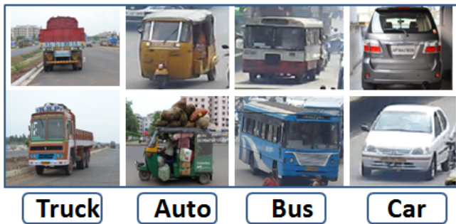
Figure 4: Vehicle recognition result that shows the images which are correctly recognized

These are used for training the SVM [21]. Testing is performed with total of 4*50=200 samples. Multi-class classification is done with a support vector machine (SVM) trained using the one-vs-rest rule.