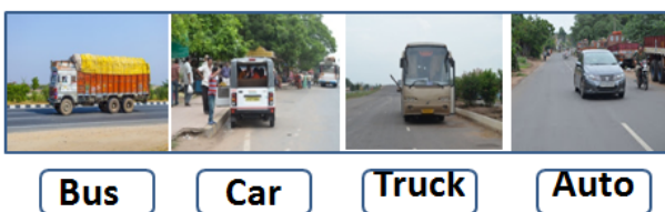
Figure 5: Vehicle recognition result that shows the images which are wrongly recognized

There is an increase in accuracy percent by the apply of BOF as feature extraction and SVM as a classifier. Accuracy percent for the present case is between 78-90. This has shown in Table-III. It also illustrates that the best results are yielded in the case of RBF kernel [22] among the three types of kernels like linear, quadratic and RBF along with bag of features.