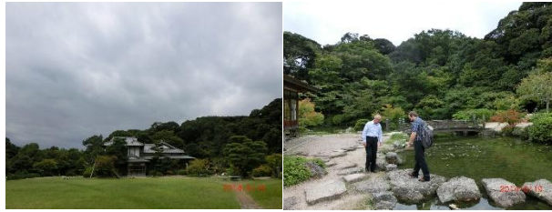
Chofu Japanese garden