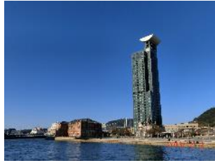
Mojiko Retro area & tower

Kanmon Tunnel (under the Kanmon Strait and you can cross it on foot!)