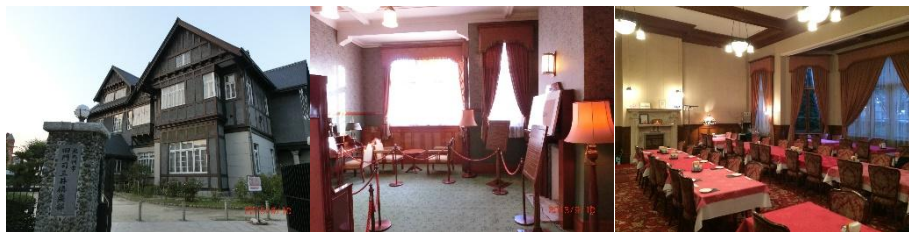
Former Mitsui Club